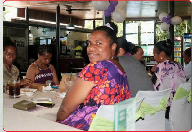
Wendy was made for the spotlight.