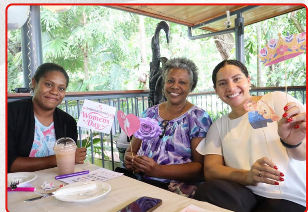
Smiling brighter because it's International Women's Day.