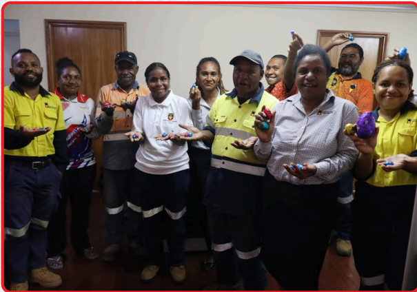
Egg-cited and proud. The team showing off their colorful wins after the easter egg hunt.