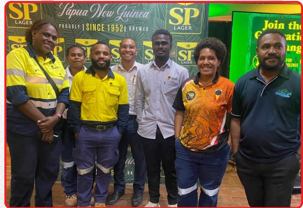
The team attended their first YPOMCCI networking event, gaining valuable connections and new opportunities.