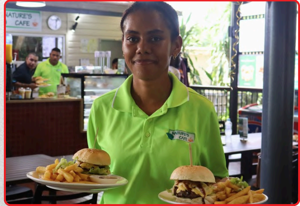
Top-tier customer service is served right with a smile.