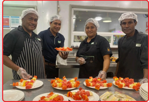
From prep to plate to proud moment. This is what team work looks like.