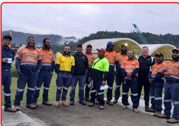
All smiles for the JPFSL team at Herd-base.