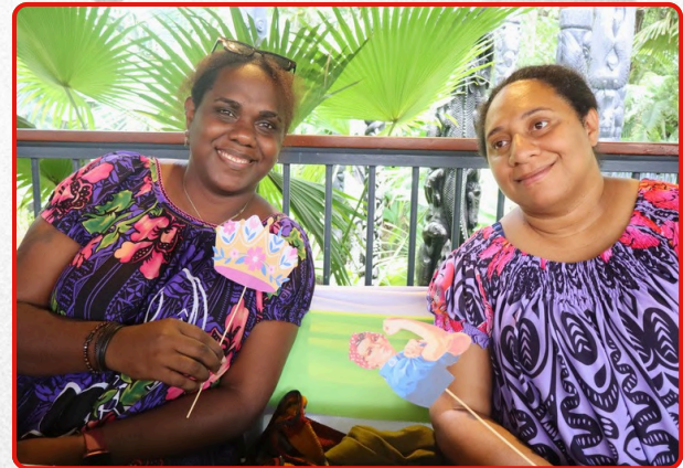
Pretty in purple.