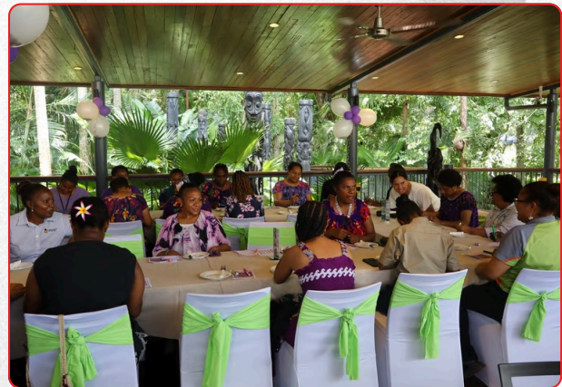
A lovely set up done by the Nature's Cafe team.