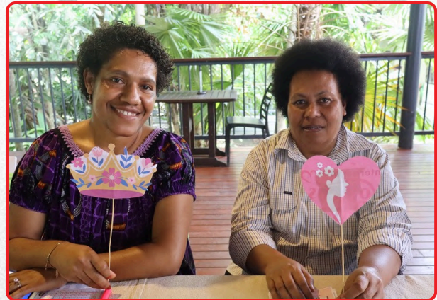
All smiles celebrating International Women's Day.